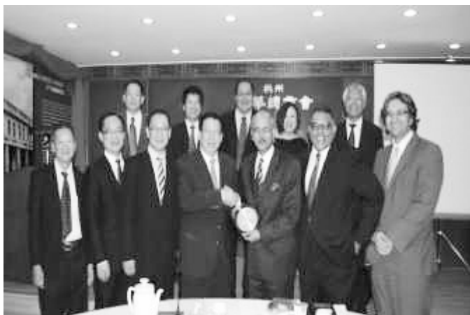
02/09/2013 巴基斯坦大使莅访本会 H.E. The High Commissioner of Pakistan paid courtesy visit to the Chamber