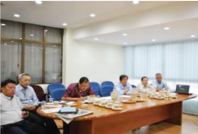
25/10/2013 收视及评估 2014 年度国家财政预算案 Live Telecast Viewing of National Budget 2014