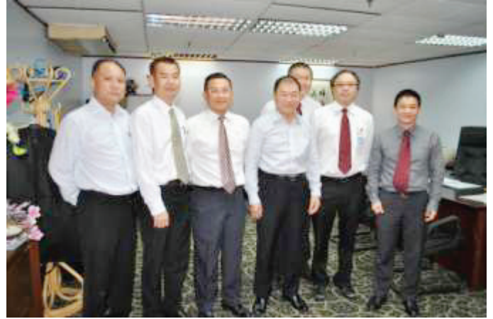
21/10/2013 本会拜访槟州公共工程、基本设施 及交通委员会主席林峰成 PCCC paid courtesy visit to Penang State Executive Councilor for Public Works, Utilities and Transportation, Y.B. Mr. Lim Hock Seng