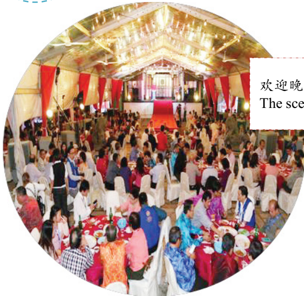
欢迎晚宴现场一瞥 The scene of Welcoming Dinner