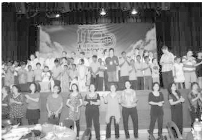
04/07/2013 槟州中华总商会爱心、关怀、感恩晚宴 PCCC Affection, Caring and Appreciation Dinner