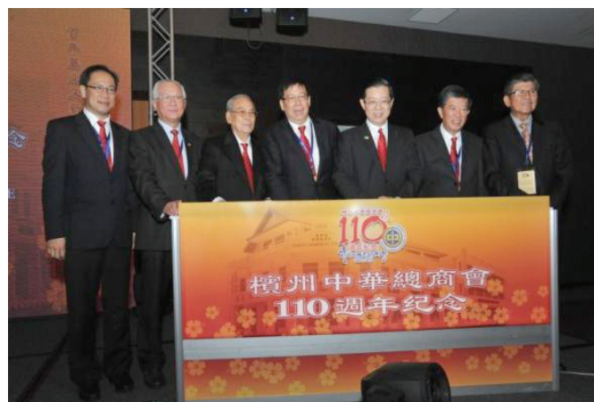
首长林冠英(右三)为槟中总110周年庆典主持开幕仪式。 The Penang Chief Minister YAB Mr. Lim Guan Eng (3 rd from right) officiated the Opening Ceremony of Chamber's 110 th Anniversary.