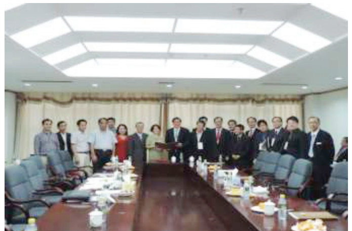
07/11/2013 本会与海南总商会签署友好协议书 Signing of the Friendship and Cooperation Agreement between PCCC and Hainan General Chamber of Commerce