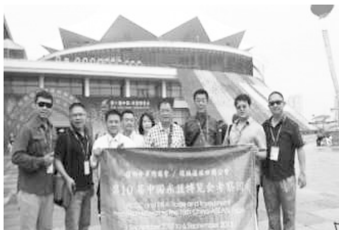
03- 06/09/2013 本会与檳城进出口商公会 赴第 10 届中国东盟博览会考察团 PCCC & Penang Importers & Exporters Association delegation to the 10 th China ASEAN Expo