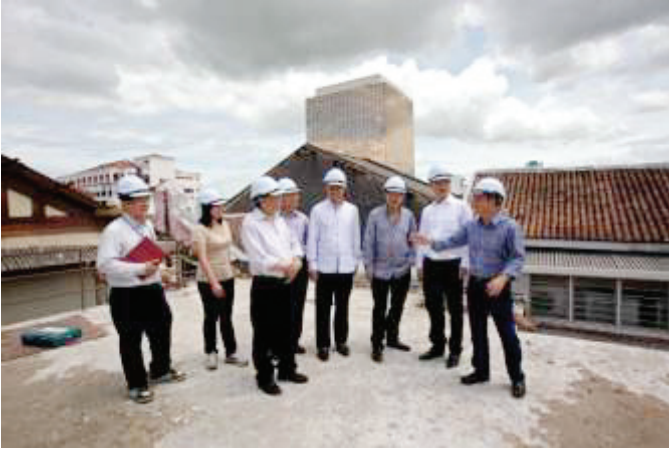
06/09/2013 勘察商会旧大厦修复工程 Inspection of PCCC Old Building