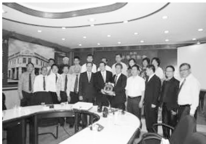
25/07/2013 巴生中华总商会偕同中国义乌侨务委员会代表团莅访 Delegation of Klang Chinese Chamber of Commerce and Industry and Overseas Chinese Affair Committee of Yiwu, China paid courtesy visit to the Chamber