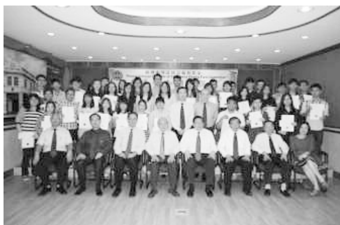
30/08/2013 2013 年度慈善基金奖贷学金颁发仪式 Charity Fund Committee Scholarship and Study Loan Presentation Ceremony 2013