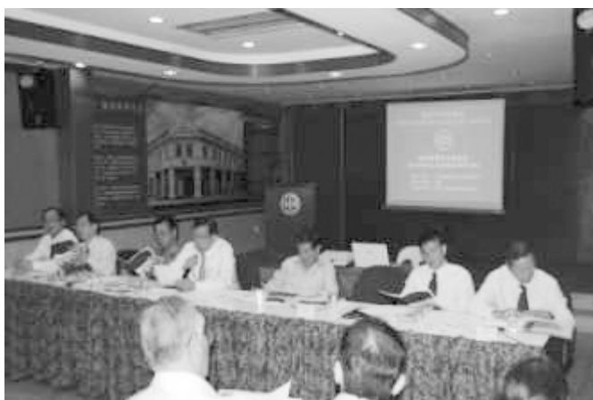
01/08/2013 本会 2013 年常年会员大会 PCCC 2013 Annual General Meeting