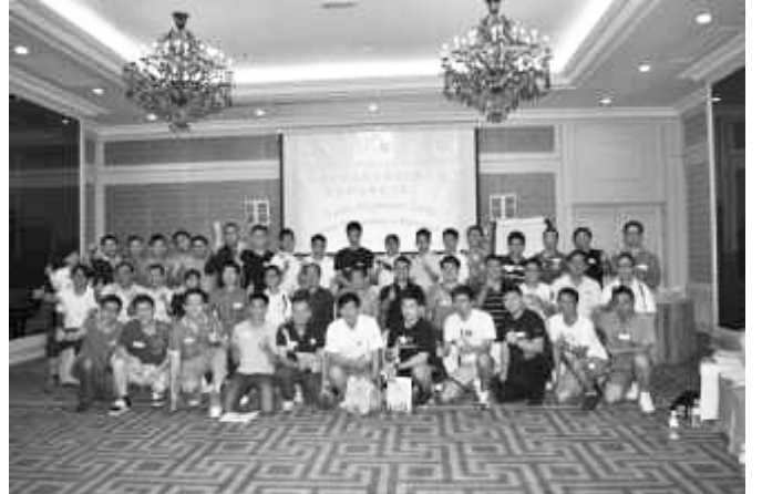
本会青商团 2013 年度常年团员大会 PCCC Young Entrepreneur Section (YES) 2013 Annual General Meeting