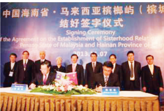
07/11/2013 中国海南省. 马来西亚槟榔屿(槟城) 州签署友城协议书 Signing of Friendship Cities Agreement between Penang State of Malaysia and Hainan Province of China